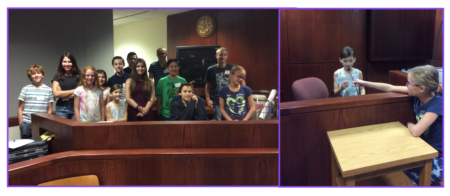
OPIS students have their day in court.