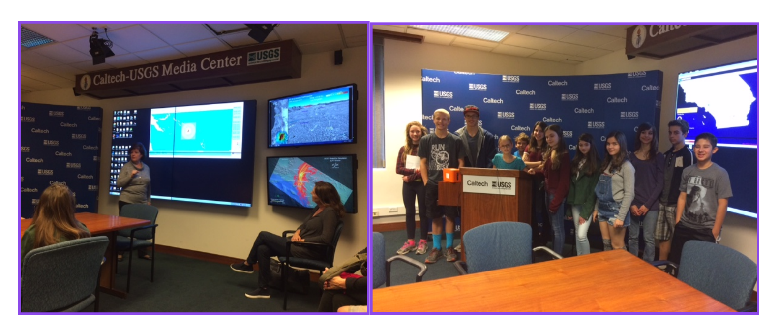
OPIS students learn about earthquakes in the Cal Tech Media Center

Cal Tech Seismology Center As luck would have it, our trip to Cal Tech coincided with a 6+ magnitude earthquake in Northern California! Fortunately for us, the media had gone by the time of our visit so we were able to see the incredible computer images of the likely path of destruction that may occur when the promised "Big One" hits Southern California. If we learned anything, it was to BE PREPARED! We were told that it could take 18 months to recover from the devastation of a large quake!